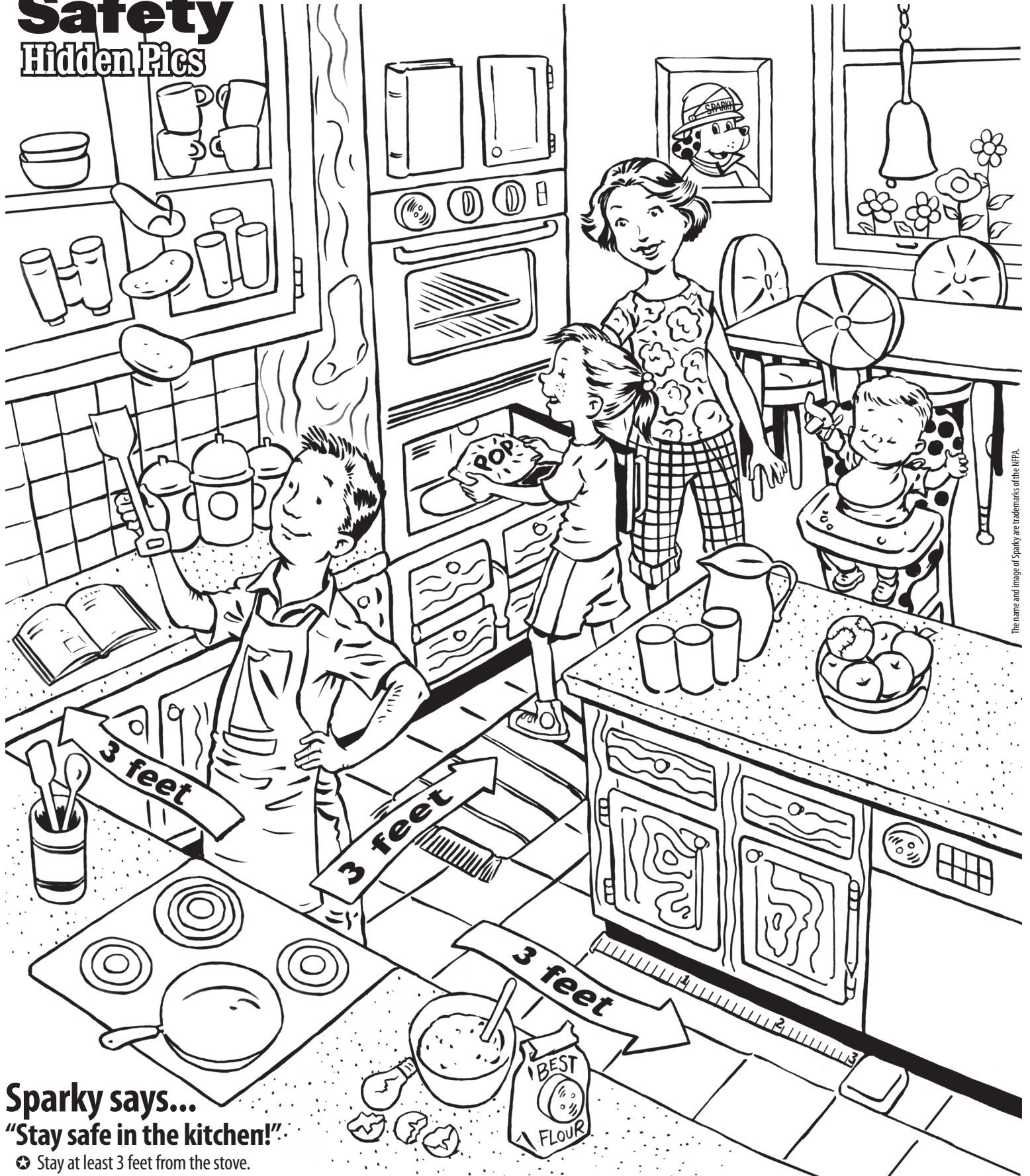
The name and image of Sparky are trademarks of the NPPA.

See if you can find: binoculars, flip-flop, sock, sand shovel, fire hydrant, sailboat, pizza slice, hammer, comb, book, ice cream cone, leaf, eyeglasses, baseball, banana, butterfly, lightbulb, bell, fried egg, beach ball, baseball bat, pencil, tape measure, 3 smoke alarms!